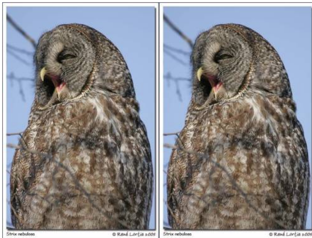
Figure 2: Images side by side

Figure 2 illustrates the placement of two images side by side.