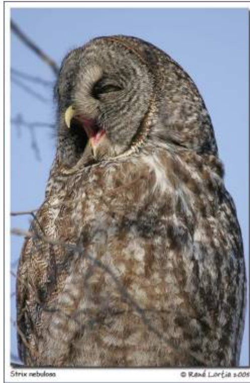
Figure 1: Owl

Figure 2 illustrates the placement of two images side by side.